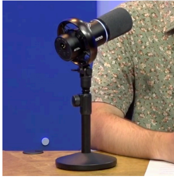
Podcast Mics (Tabletop)