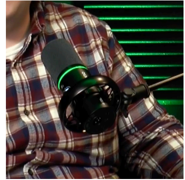
Podcast Mics (Boom Arm)